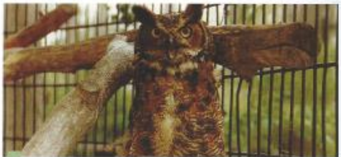
Lohr loved to photograph the birds of the Zoo. Here, she got a perfect shot of the Great Horned Owl and its intense stare.