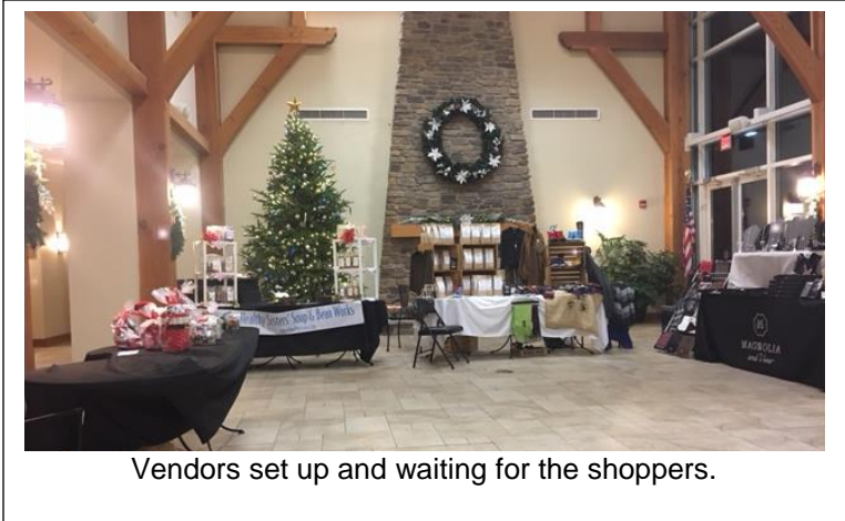
Vendors set up and waiting for the shoppers.