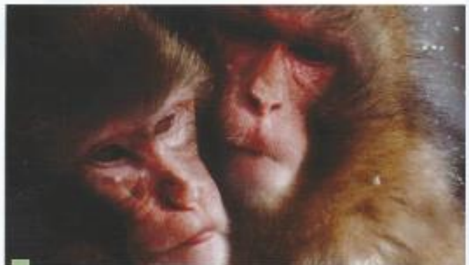
In this serene photo of the Japanese Macaque, Lohr captured a tender moment among these two primates.