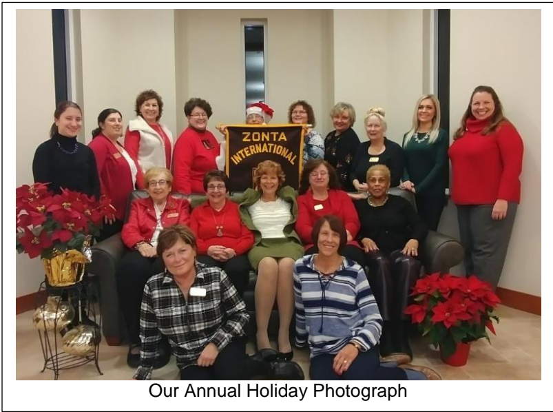
Our Annual Holiday Photograph