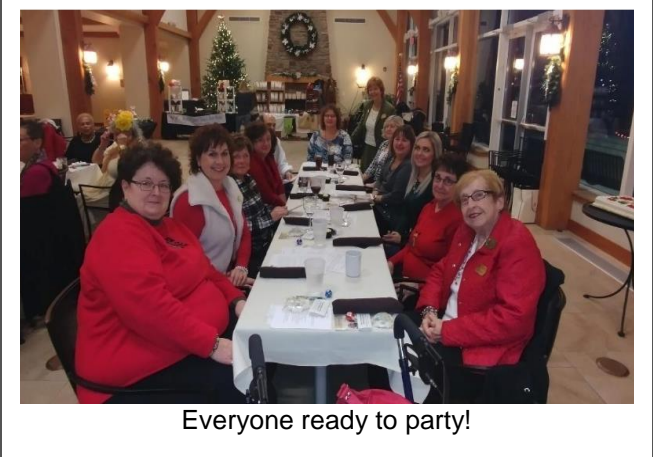
Everyone ready to party!