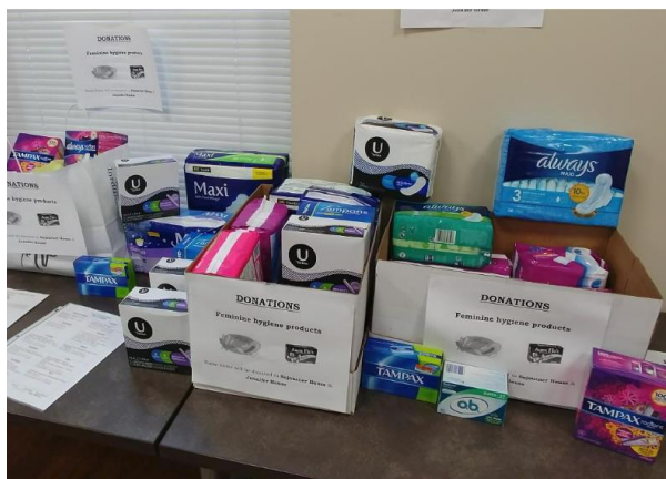
Donations from March's Meeting!

The next two dinner meetings we will not have a designated donation, but we will resume in June at the president's meeting.