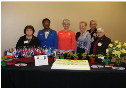
Past and Current Governors