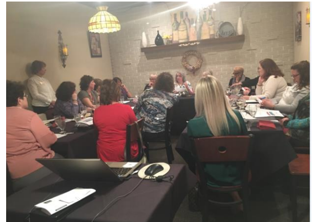
Discussion on Leadership Training